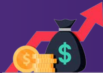
BOOST - GROWTH