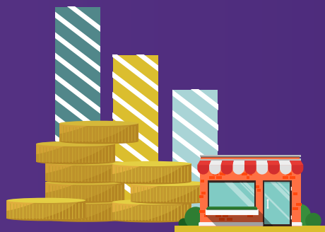
CAPITAL - SMALL BUSINESSES